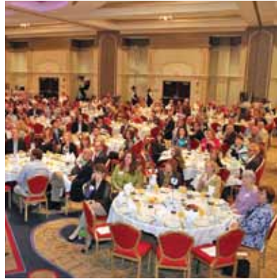
SUPPORTING OUR VISION